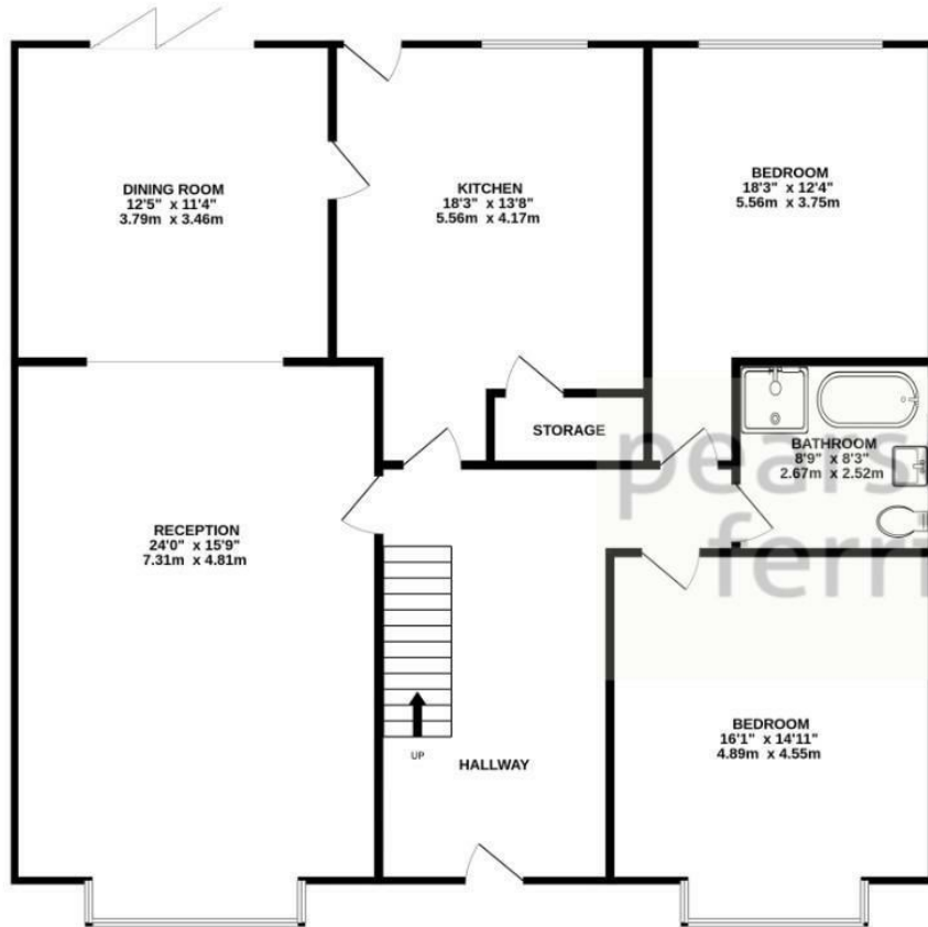
GROUND FLOOR 1472 sq.ft. (136.8 sq.m.) approx.